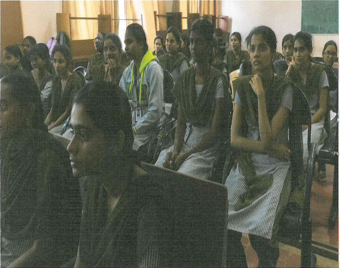
Students attending an awareness program on Women issues in society

Approved by AICTE, New Delhi & Affiliated to JNTUK, Kakinada