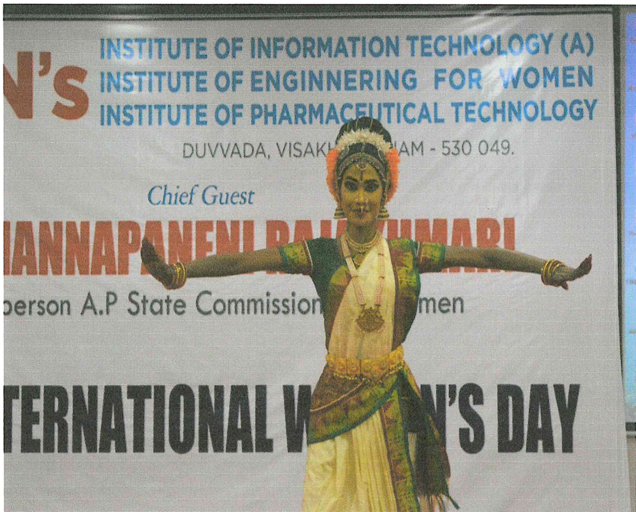
Classical Dance Performance in International Women's Day celebrations

Objective: To celebrate the extraordinary acts of women and to join forces to advance gender equality around the world.